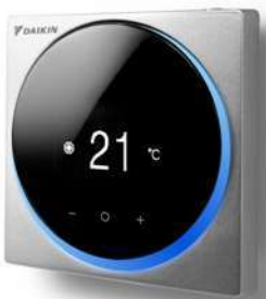
Silver RAL 9006 (metallic) BRC1HHDS