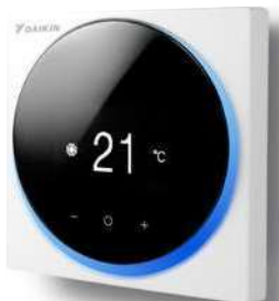
White RAL9003 (glossy) BRC1HHDW