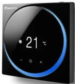
Black RAL 9005 (matt) BRC1HHDK